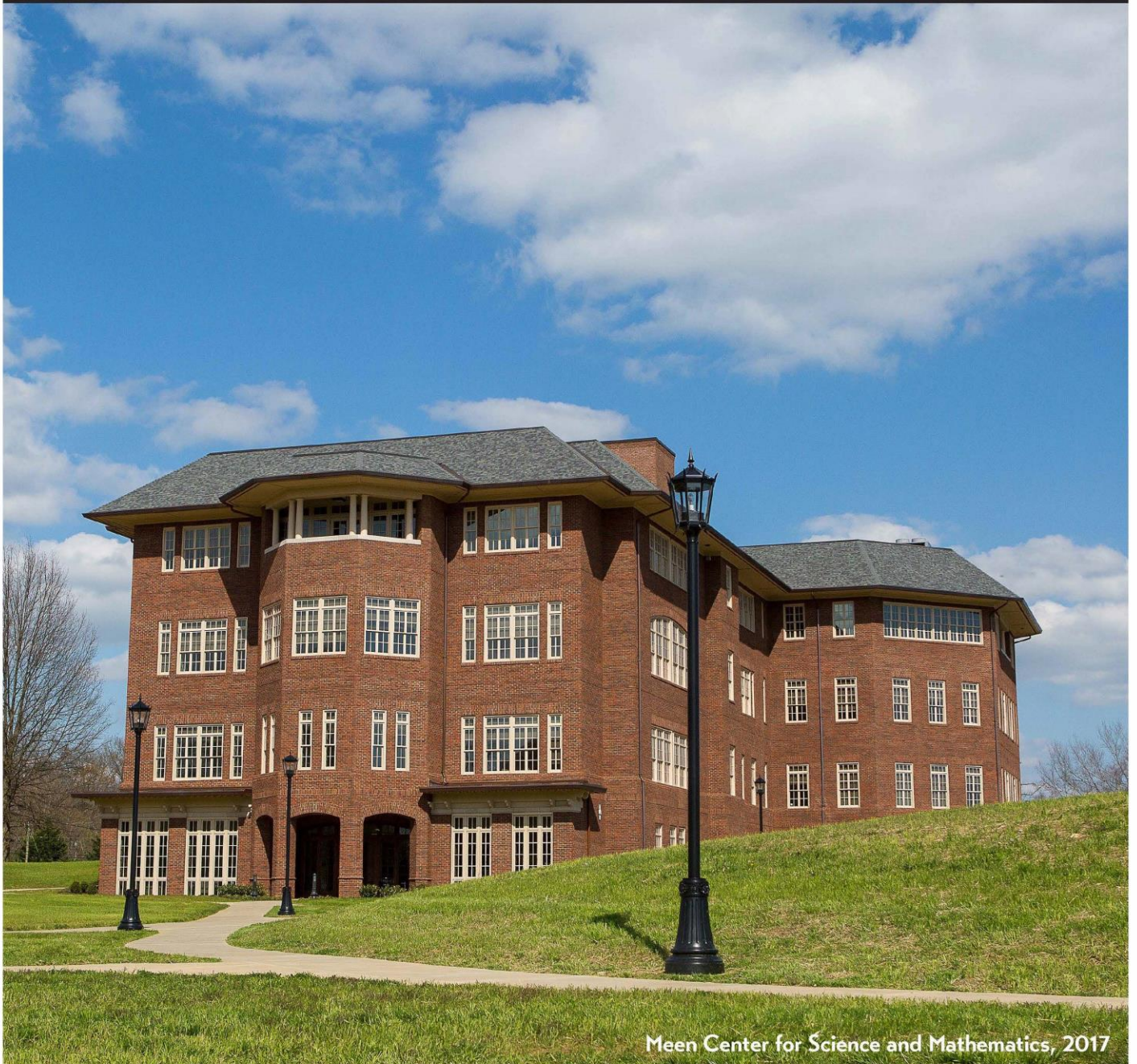
Meen Center for Science and Mathematics, 2017